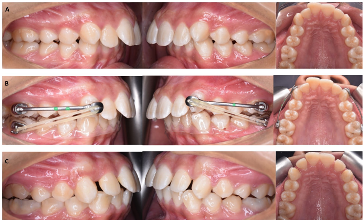
Fig. 2 Intraoral photos of a case in EXG; A predistalization, B Intervention, C postdistalization photos