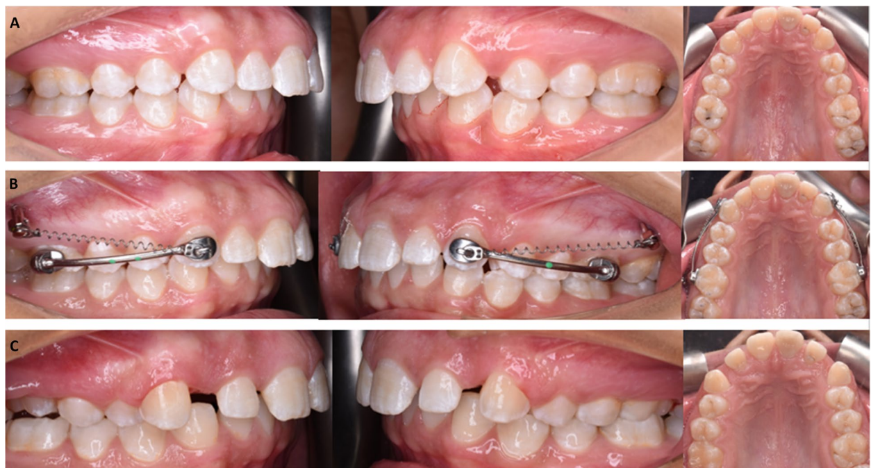
Fig. 1 Intraoral photos of a case in IZCG; A predistalization, B Intervention, C postdistalization photos