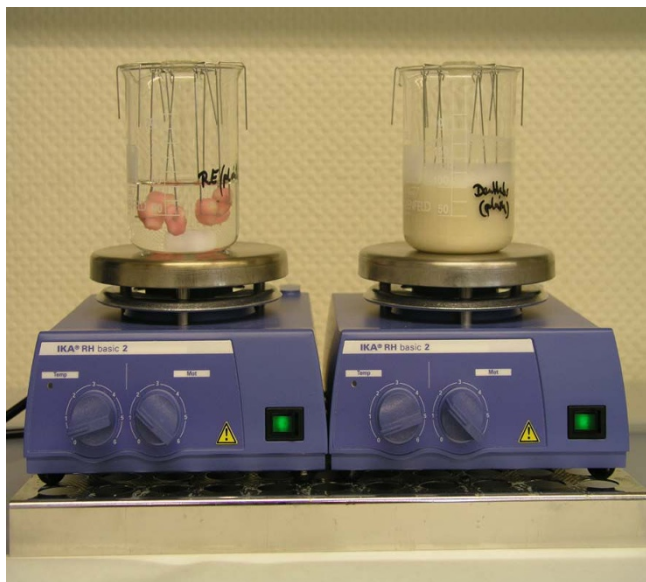
Figure 1 Setup of the incubation procedure. The wax coated teeth were fixed to metal wires and were hanging in the different incubation media. The incubation media were constantly slowly agitated with a magnetic stirrer.

of each solution was 100 ml. These solutions were constantly agitated using a magnetic stirrer. All cycles were executed under constant climatic conditions at 37°. The window areas were microphotographically controlled before pH-cycling to discard specimens with enamel cracks of iatrogenic scratches and to document the artificial white spot lesions after 18 days.