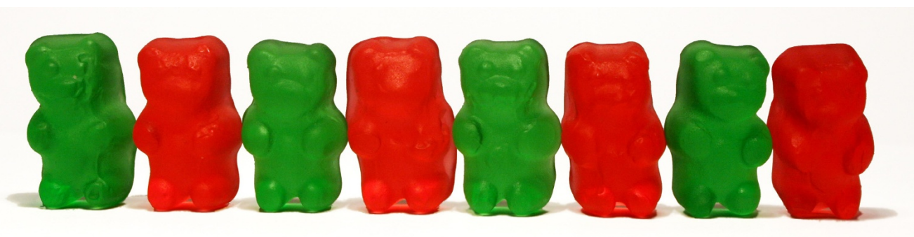
Figure 1 Photograph of Xylitol and Maltitol Gummy Bears.

Unit-dose packages were ordered by day and session for each child and pre-packed into bins by classroom before being delivered to the schools weekly. School principals identified people who regularly served as classroom volunteers to hire as community workers for the study. Those women received training in the Responsible Conduct of Research at the University of Washington and were trained to distribute and monitor consumption of the gummy bear snacks in the classroom. The community workers established a schedule with the teachers that allowed them to cover all classrooms three times over the course of the school day at approximately even intervals. The unit-dose packages were distributed according to the child's assigned ID number, date and session number. The community workers observed the consumption of the gummy bears and immediately collected and recorded any unconsumed gummy bears, including those for any absent children. Classroom logs were faxed to the research staff daily to monitor study progress. Incompletely consumed packages of gummy bears were stored in the staff workroom and were picked up by the research staff weekly and checked against the classroom logs for accuracy.