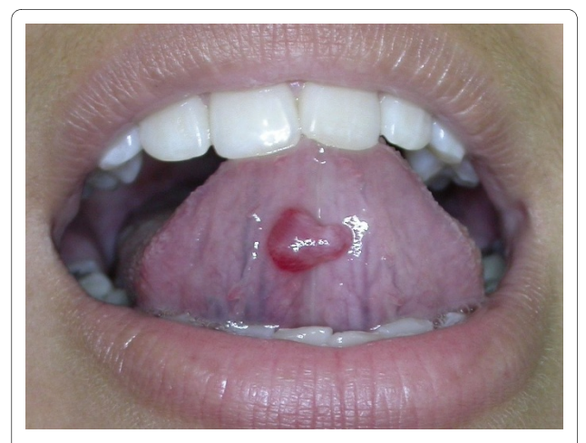
Figure 3 Mucocele of the gland of Blandin-Nuhn (ventral tongue) . Pediculated turgid nodular lesion, measuring 3.0 cm in diameter.

Figure 1 Distribution according to age of cases of mucoceles diagnosed between April 1980 and February 2003 at the Discipline of Stomatology Department of Biosciences and Oral Diagnosis, São José dos Campos Dental School, São Paulo State University.