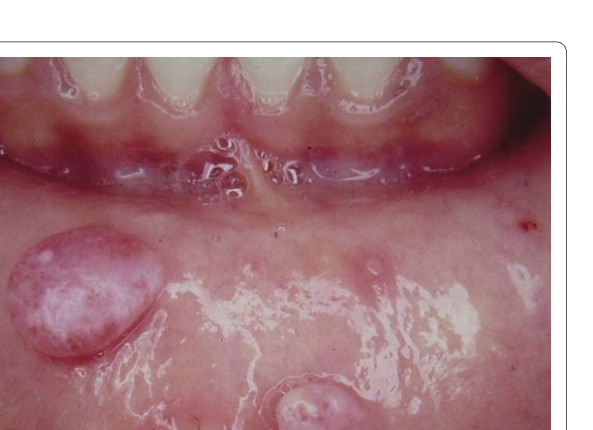
Figure 2 Turgid nodular lesions located on the lower lip.

Mucoceles were located on the lower lip in 78% of cases (Figure 2), on the ventral tongue in 9.83% (Figure 3), on the floor of the mouth in 9.25% (Figure 4), and on the soft palate, buccal mucosa (Figure 5) and lingual frenum in 0.58% each.